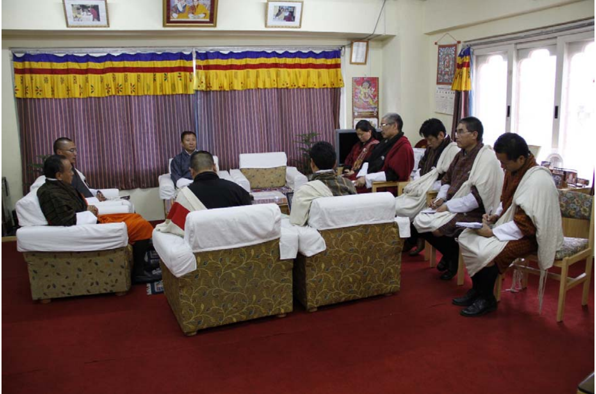
ECB meets with the DPT, PDP and DNT on 10 th of June 2013 to discuss DNT Candidates Joining PDP for the General Elections 2013

He expressed his hope that the Parties formed by responsible, committed and dedicated members of the Bhutanese society will carry out the electoral affairs lawfully including advising their social network users and well-wishers controlling their members, supporters, and workers to be responsible towards ensuring a peaceful and model Second Parliamentary Elections 2013.